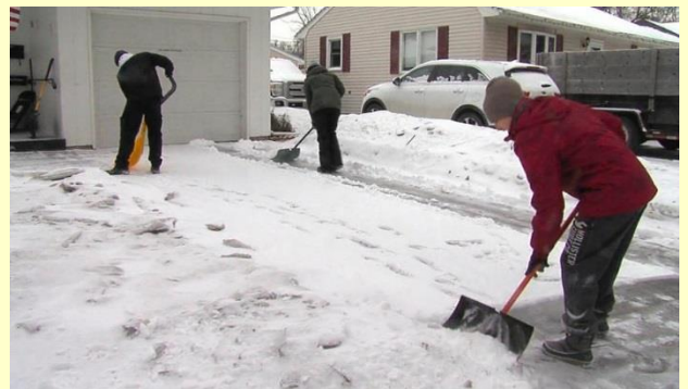
Cadets shoveling a Veteran's driveway for Operation Snow Angel

This past year the Bison Battalion Cadets reached out and helped out local community veterans and alumni as well as sponsored several blood drives at NDSU. Operation Snow Angel was a resounding success among the veterans who signed up to have our students come and assist with cleaning their driveways during major snow storms. Cadets also volunteered to assist multiple veteran or alumnus with local moves within our community. In addition, our cadets volunteered or worked with several veteran organizations this past year to include Honor Flight, ROA, and VFW.