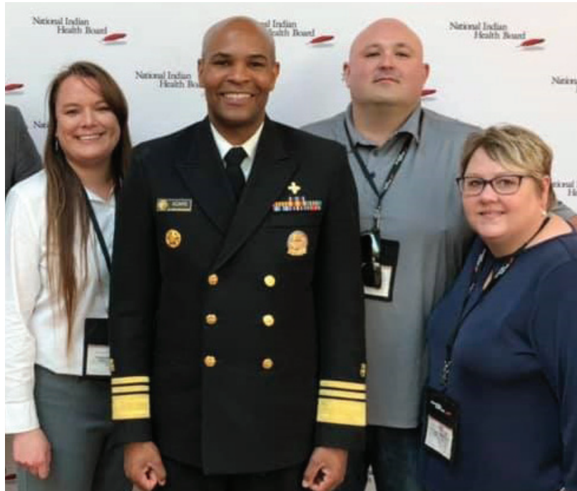
AIPHRC Team with the Surgeon General