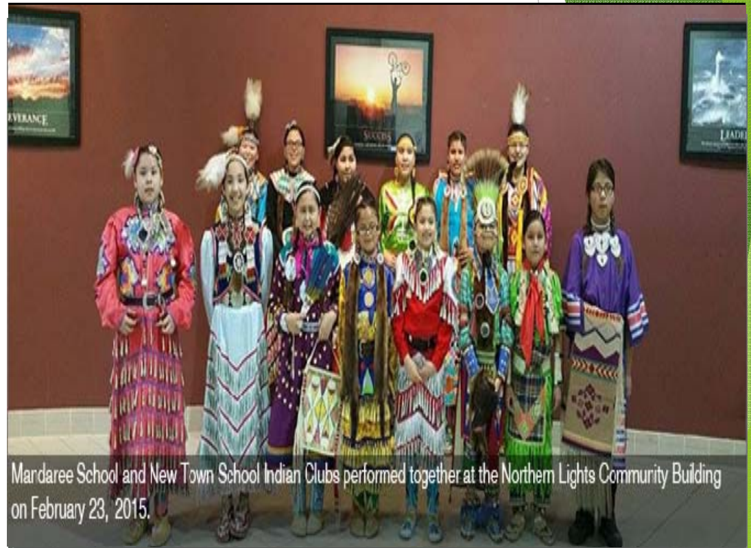
Mandaree School and New Town School Indian Clubs performed together at the Northern Lights Community Building on February 23, 2015.