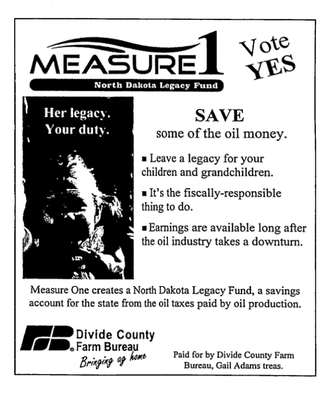
Figure 1: An advertisement by the Divide County Farm Bureau published in a local newspaper on October 27, 2010

With few legal constraints on how legislators can use the funds, the number of proposals has grown. Numerous interests have begun to engage the process since 2017, garnering significant discussion and opposing viewpoints. Public officials have endorsed a wide variety of approaches for using the Legacy Fund. For example, North Dakota Governor Doug Burgum has frequently discussed his vision for the Legacy Fund in his State of the State address.