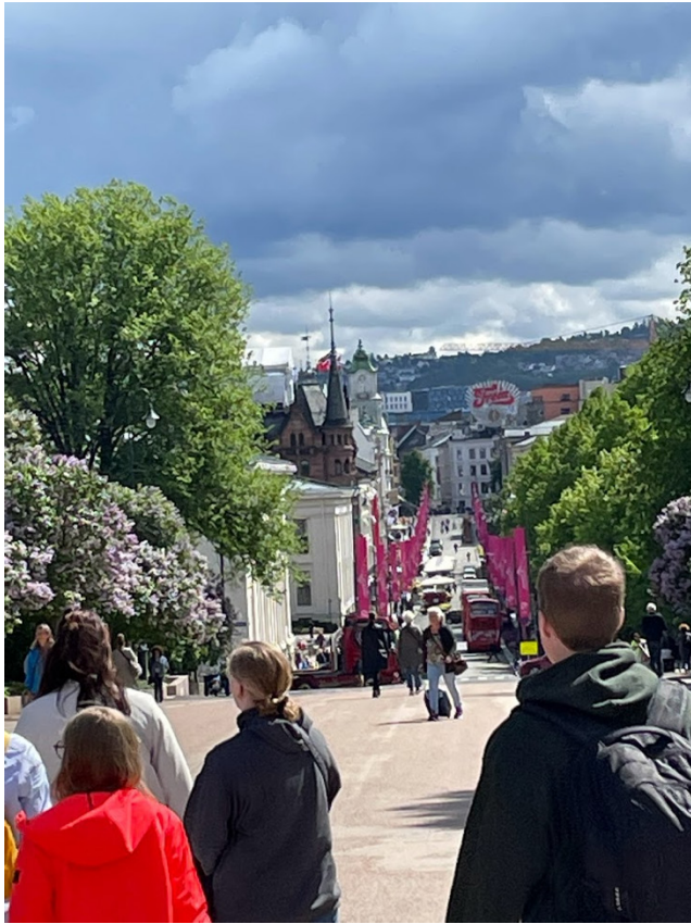
Just a view of one of the streets in Oslo.

After our tour of the city that day, we went to Halden Prison, which is on the border between Norway and Sweden. We weren't allowed any personal items inside of the prison, so this is the best picture I could get. While we were there, we talked with the warden, talked with some inmates, and got a tour. Based on a survey of students, this part of the tour received a 10 out of possible 10 for enjoyment!