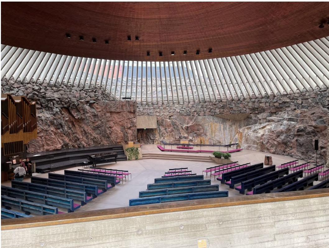
Tempeliaukio Church, which is built into a rock. The acoustics here were amazing.