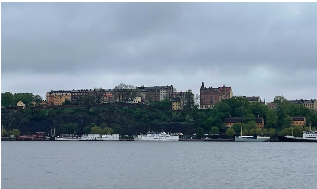
This is a picture of part of Stockholm. There are a lot of waterways dividing up the city. I took this picture standing outside Stockholm's City Hall.