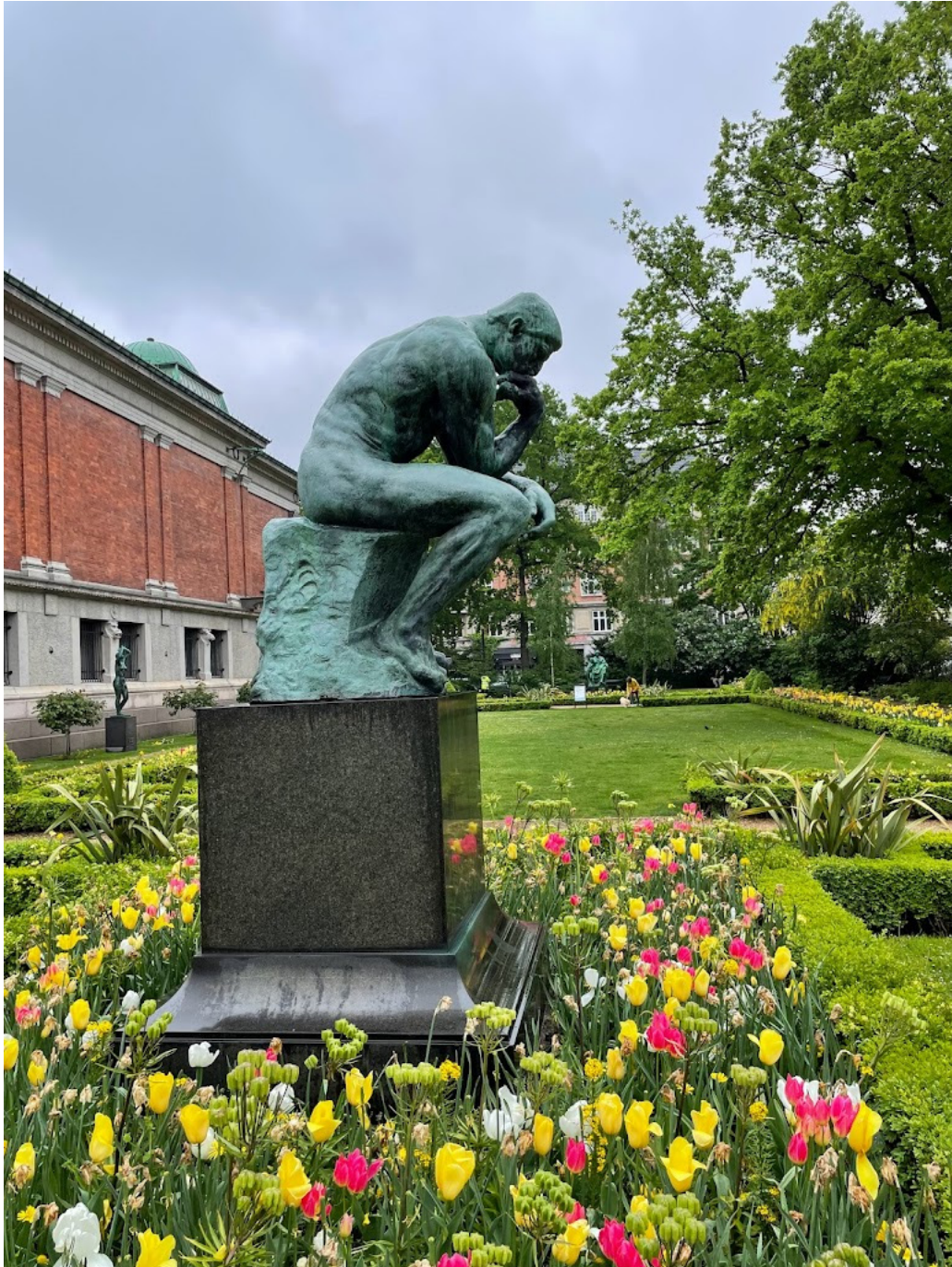
Copenhagen has a lot of lovely gardens.