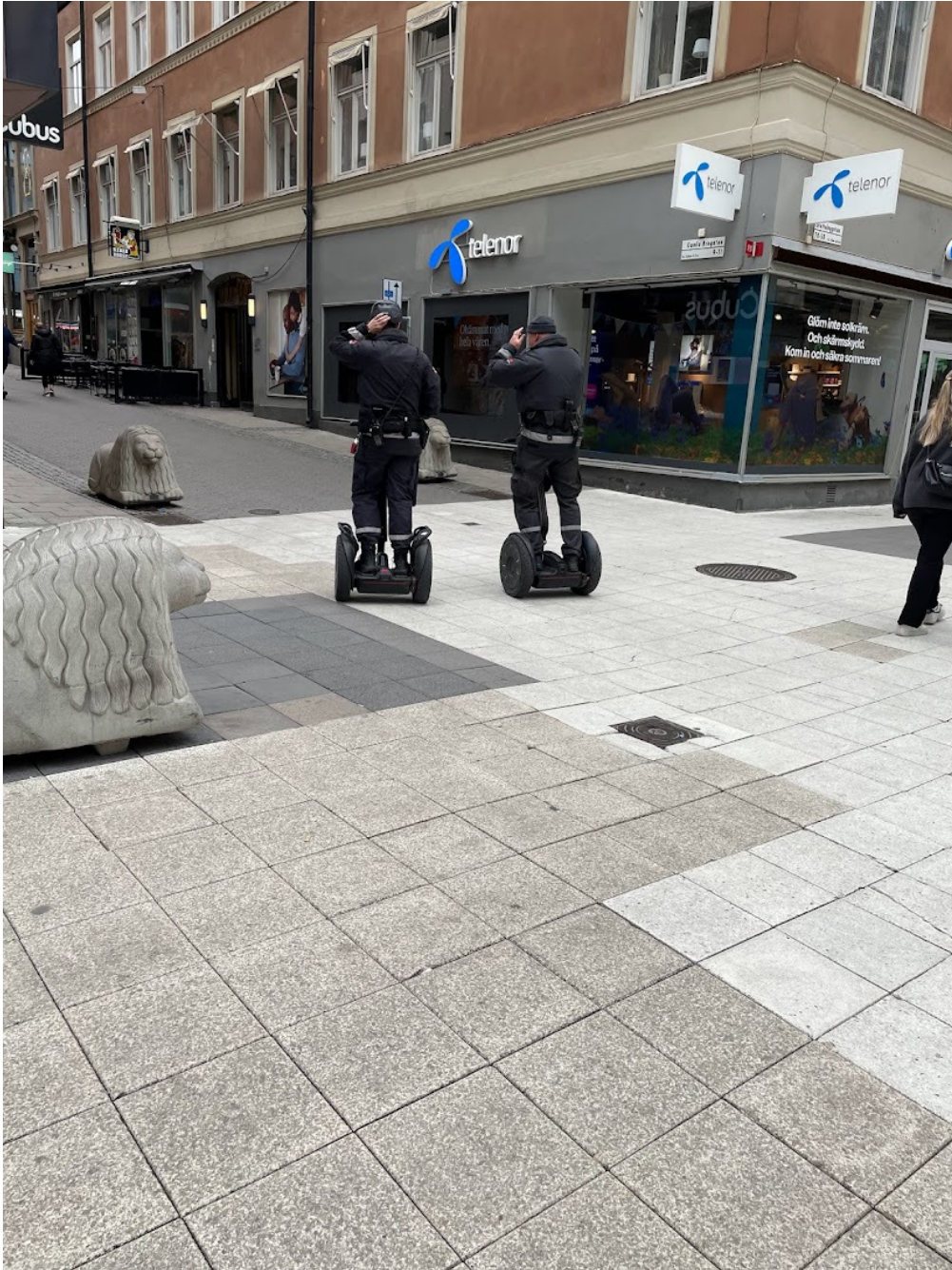
Police officers on Segways in Stockholm.