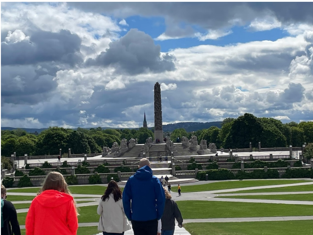
On our tour of Oslo, we went to Vigeland Sculpture Park. It is an enormous park filled with his sculptures.