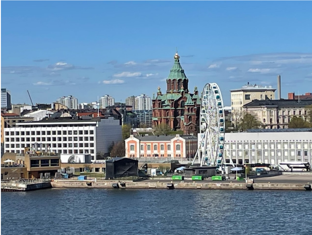
Took this picture from the deck of the ferry as we were leaving Helsinki to Stockholm. A few students went up on that ferris wheel the previous day.