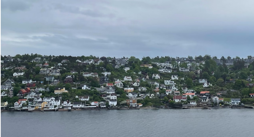
This picture was taken on the ferry from Copenhagen to Oslo.