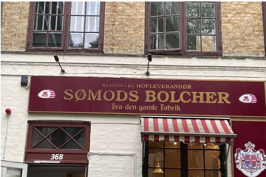
As a part of our food tour, which mainly consisted of trying honey, flodeboller, pastries, and licorice (they love licorice in that area of the world!), we went to this candy shop where they made some hard candy in front of us. After this, the food tour concluded with a hot dog that seemed to be a hit among the students.