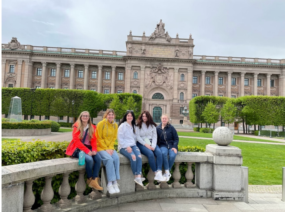
A group of criminal justice students outside of Swedish Parliament.