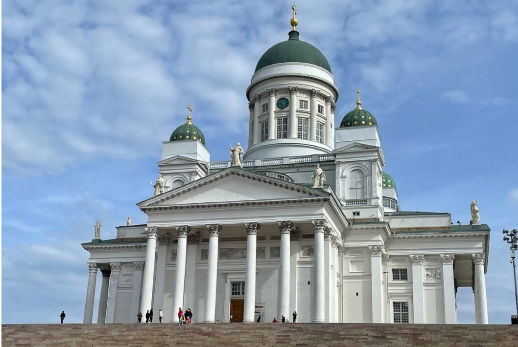
Helsinki Cathedral. We didn't go in here or into any of the other buildings in the Senate Square. Some of us did, however, find a pizza place close by that had fantastic pizza.