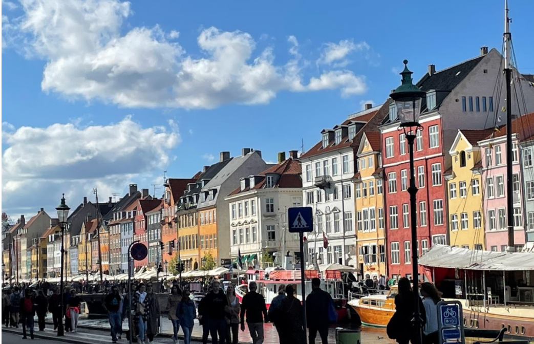
A view of one of the areas of Copenhagen.