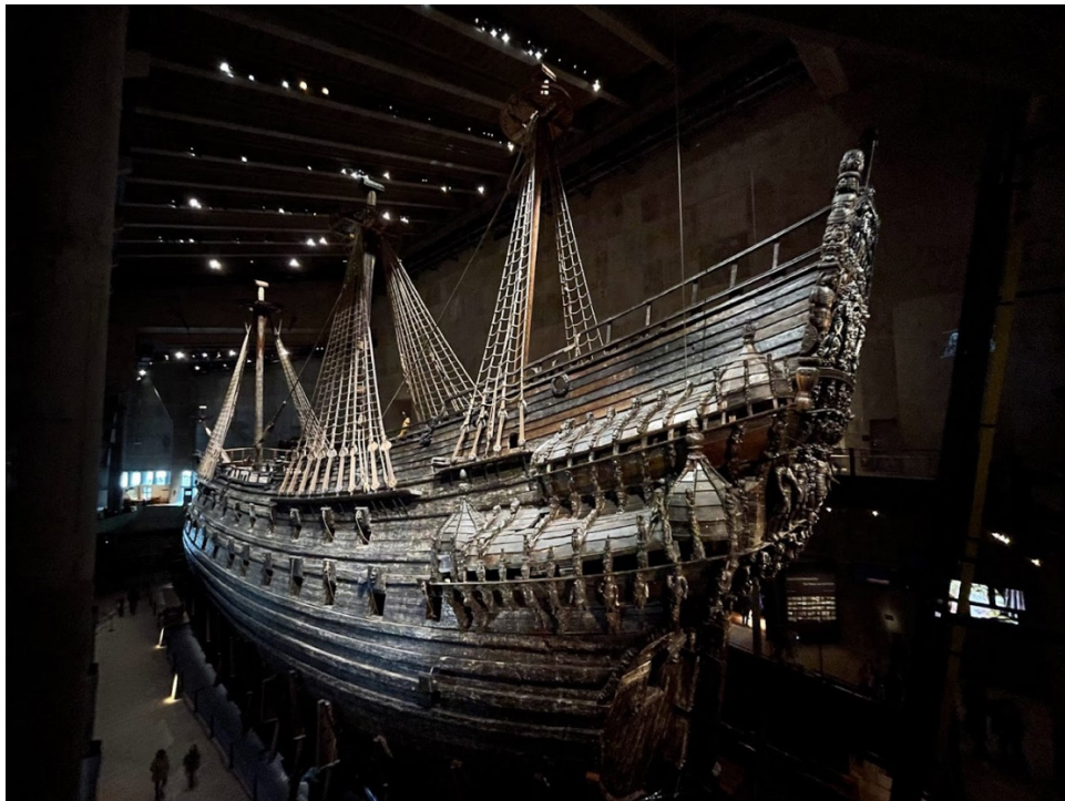
Inside the Vasa Ship Museum. Really cool Viking ship. Very intricate details, but alas a terrible ship for sailing. It sank after 20 minutes in the water because there had been more concern with aesthetics than making sure it would float!