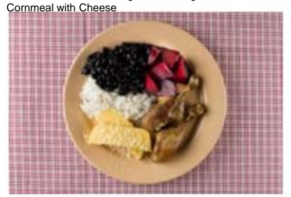
Arroz, feijão, coxa de franço assada, beterraba e polenta com queijo

Rice, beans, Chicken Thigh Roast, Sugar beet, Cooked