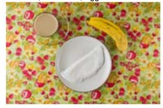
Café com leite, tapioca e banana