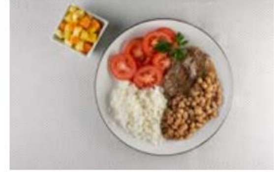
Salada de fomate, arroz, feijão, bife grelhado e salada de frutas

Feijoada, Rice, Vinaigrette, Cassava Flour, Collard and Orange http://bvsms.saude.gov.br/bvs/publicacoes/guia_alimentar_populacao_brasileira_2ed.pdf