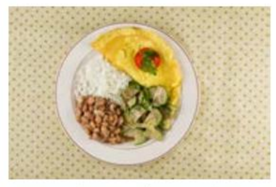
Arroz, feijão, omelete e jiló refogado