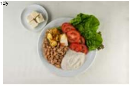
Alface, tomate, feijão, farinha de mandioca, peixe e cocada

Lettuce, Tomato, Beans, Cassava flour, fish and coconut