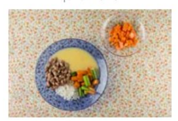
Arroz, feijão, angu, abóbora, quiabo e mamão Rice, Beans, Cooked cornmeal, Pumpkin, Okra and papaya

Lettuce, Tomato, Beans, Cassava flour, fish and coconut