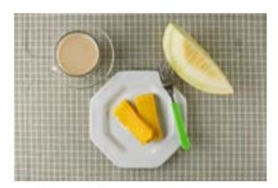
Café com leite, bolo de milho e melão