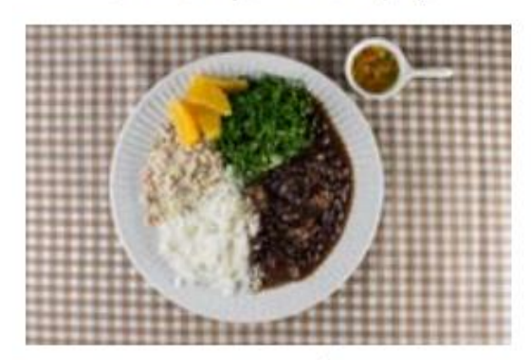
Feijada, arroz, vinagrete de cebola e tomate, farofa, couve refogada e laranja

Feijoada, Rice, Vinaigrette, Cassava Flour, Collard and Orange http://bvsms.saude.gov.br/bvs/publicacoes/guia_alimentar_populacao_brasileira_2ed.pdf