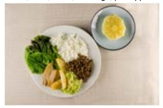
Alface, arroz, lentilha, pernil, batata, repolho e abacaxi

Lettuce, Rice, Lentil, Cabbage, pineapple