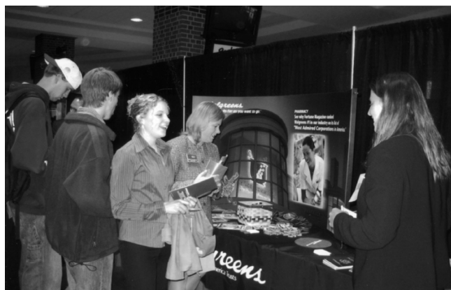
Pharmacy students and potential pharmacy students gained much from mingling with professionals in the field during the annual Career Fair.