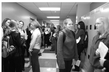
Students filled the hallway leading to the new Thrifty White Concept Pharmacy during the Nov. 4 dedication ceremony.

"We wanted to create an environment here that gives our students a unique experience that they would not be able to get in any other school in the