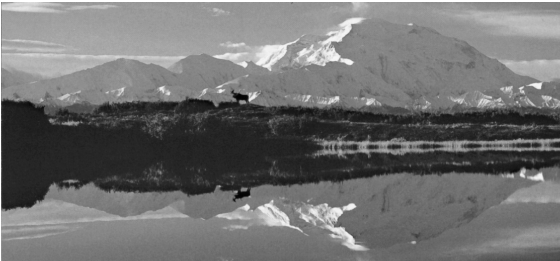
Several pharmacy alums take continuing education classes as part of a travel experience. These trips combine professional learning with sight-seeing in places like Alaska.