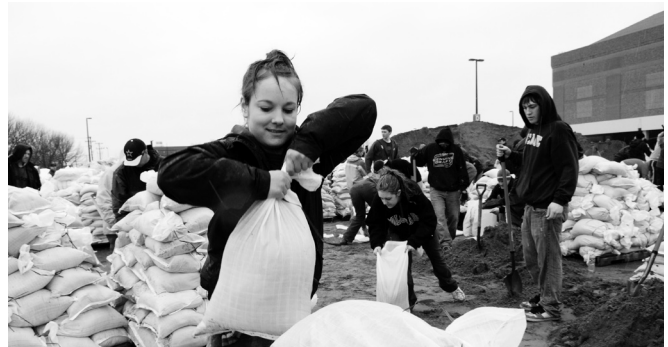
NDSU students, faculty and staff spent March 24 sandbagging at the Fargodome. Volunteers were transported to locations across the community to help fight the flood.