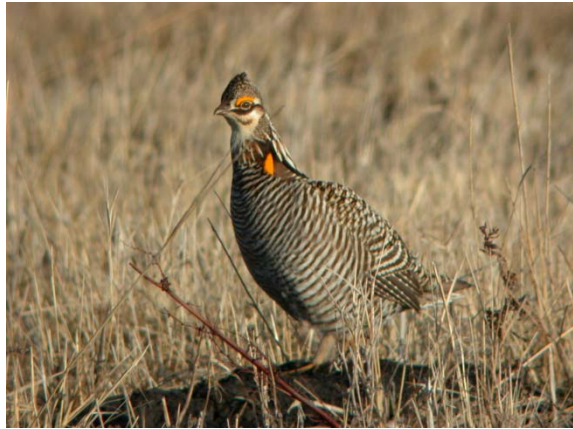
The saline grasslands of Grand Forks County are one of two sites in North Dakota that still has Greater Prairie-Chickens.

Changes in our agrarian way of life inevitably changes birdlife. A number of species benefitted from the diversified agricultural practices used on small farms. A cogent example is the Greater Prairie-Chicken 3 which may not have occurred at all within North Dakota prior to settlement, perhaps because the tall-grass prairie was heavily grazed by Bison and other large herbivores. With settlement and elimination of Bison, prairie-chickens thrived at a time when fairly large tracts of remaining prairie were unused or lightly grazed. It could be that winter survival was much greater because of grain fields, feedlots, and stacks of hay and straw. By the 1930s, numbers declined rapidly and the occupied range constricted, perhaps in response to over-grazing and the conversion of grasslands to cropland. The number present in North Dakota today is less than one-thousandth of what it was in 1930, and they are found only in the saline grasslands of Grand Forks County and the Sheyenne National Grasslands of Ransom and Richland Counties.