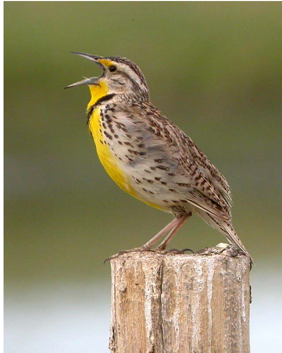
Western Meadowlark, the state bird of North Dakota and five other states, is no longer found in large areas of the Red River Valley.

Theodore Roosevelt was fond of the Western Meadowlark. A quote 5 attributed to him is "One of our sweetest, loudest songsters is the meadow-lark...the plains air seems to give it a voice, and it will perch on the top of a bush or tree and sing for hours in rich, bubbling tones." Although a meadowlark will indeed sing from a tree, shrub, or fencepost, it is the surrounding grassland that is required for them to survive. Frequently, I am asked by members of my generation "Where have the meadowlarks gone?" It is a highly relevant question as North Dakota's state bird has disappeared from large areas of the Red River Valley. Their disappearance provides a lesson in what happens with the disappearance of grasslands.