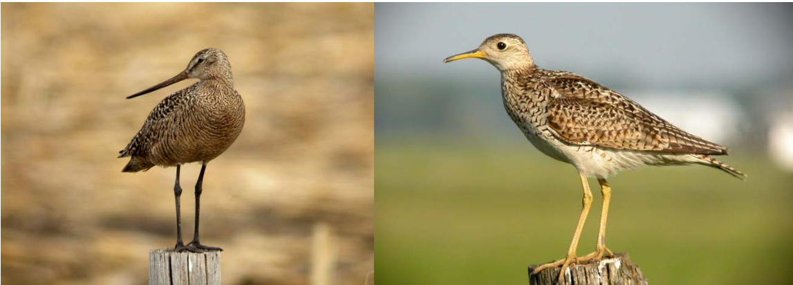
Marbled Godwit and Upland Sandpiper, two iconic grassland species that are still present as nesting shorebirds in the saline grasslands of Grand Forks County.

Within the heart of the Red River Valley, significant grasslands still exist: places where the Western Meadowlark can still be heard, where nesting Marbled Godwits and Upland Sandpipers scold passersby. Most notably, in eastern Grand Forks County, approximately 70,000 acres of semi-contiguous grassland extend from North Dakota Highway 15, west of Thompson, to the northern border of the county. Indeed, this grassland extends northward into Walsh County along the drainage of the Forest River, including Lake Ardoch N.W.R. Additional areas are found west of I-29 in Pembina County.