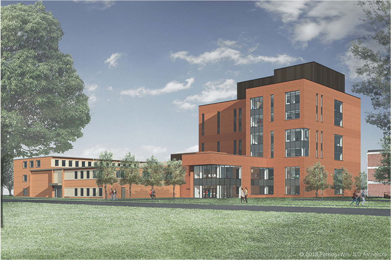
ALDEVRON TOWER OPENS JANUARY 2020