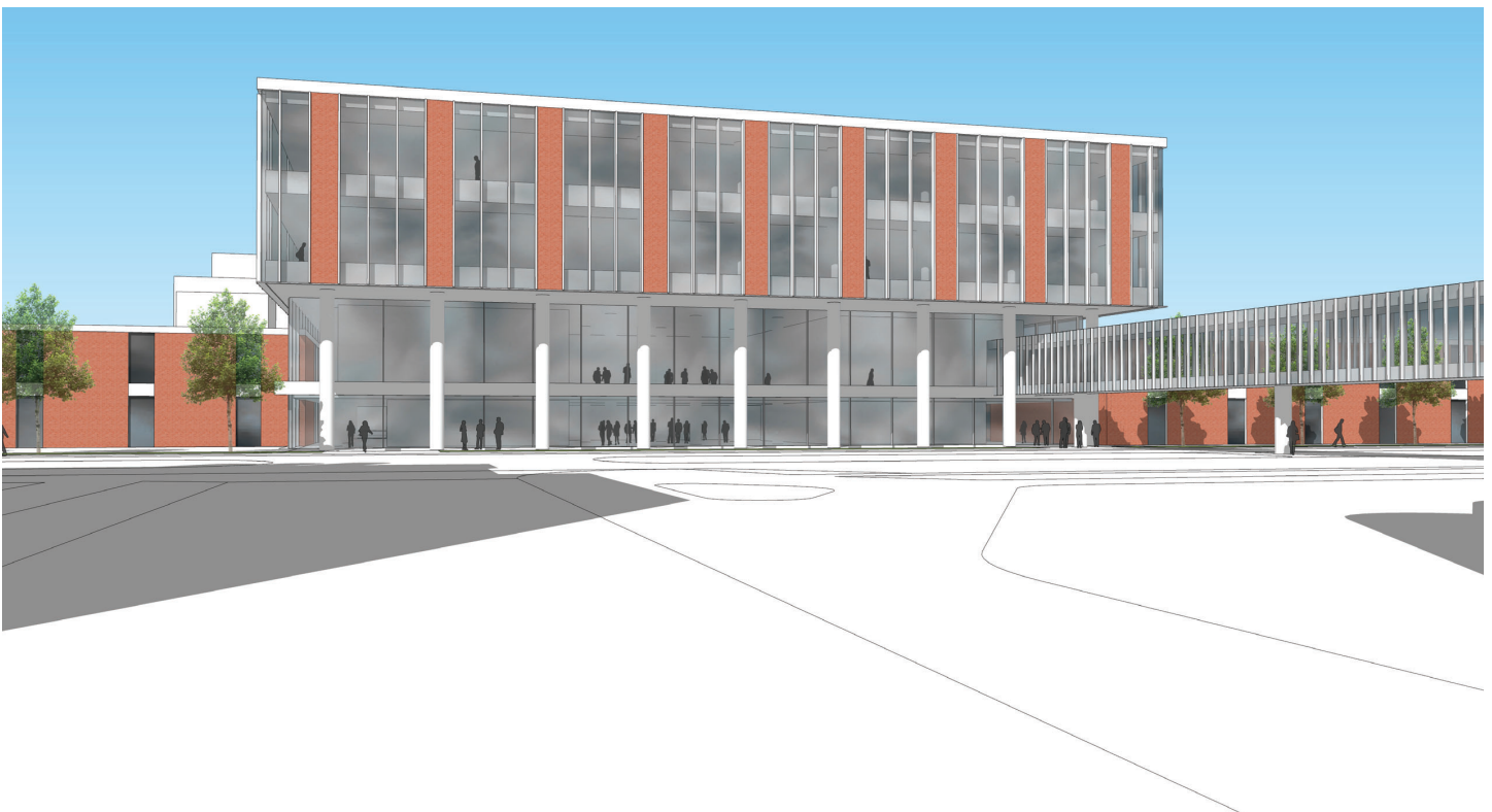
NORTH DAKOTA STATE UNIVERSITY | ENGINEERING 16 AUGUST 2022 | BWR + ZERR BERG