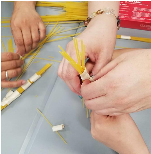
SURP Students work on a team building activity.

SURP would like to announce that it will be extending the same opportunities to the tribal colleges to host or co-host as Pop-Up Workshops! These workshops could range from 1-2 days at tribal colleges and include research topics preferred by the college. These Pop-Up Workshops are intended to: