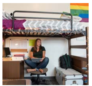
OUR NEWEST RESIDENCE HALL, CATER HALL, SUCCESSFULLY OPENED AT 90+ PERCENT OCCUPANCY