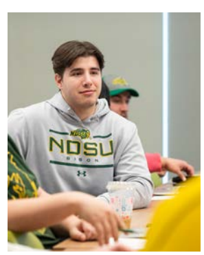
DEVELOPED AND IMPLEMENTED S.A.F.E. A NEW DIVERSITY AND INCLUSION INITIATIVE