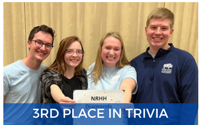
3RD PLACE IN TRIVIA