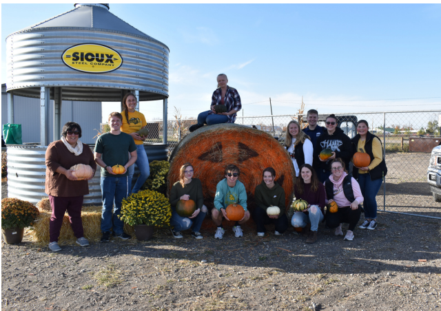
NRHH at a local pumpkin patch on October 9, 2022