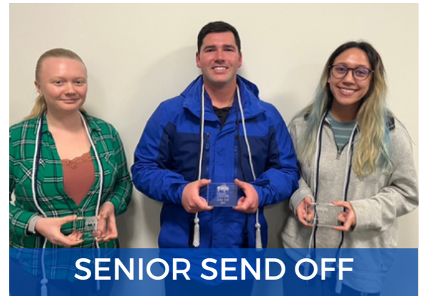
SENIOR SEND OFF