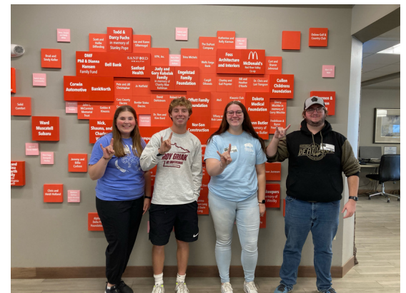
Cleaning at the local Ronald McDonald House.

NRHH has a dedicated group of individuals who help at our service events. We complete a variety of activities that aim to help others. As one of our pillars, we strive to focus a lot of our efforts in service. Many of our members thrive in a volunteer-based atmosphere. We can't wait to see what next semester brings. Check out the cool events we participated in during the fall semester!