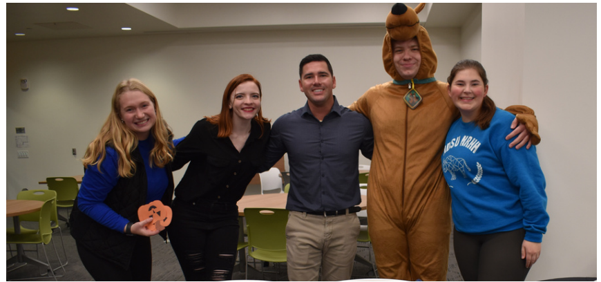
The NRHH crew had a blast helping at Boo! at NDSU on October 27, 2022