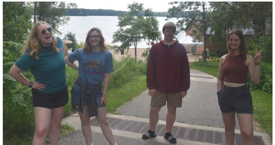
NRHH Exec team at their summer retreat

As the executive team, we are always willing to chat and learn from our amazing alumni! Do you have a fun story to share? Do you have any service or recognition ideas? Please email any of us if you have questions or want to learn more about our current chapter. Each email address can be found to the right. Please send thought and ideas our way.