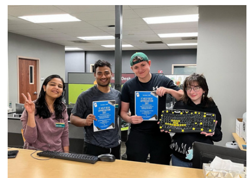
NDSU IT Help Desk