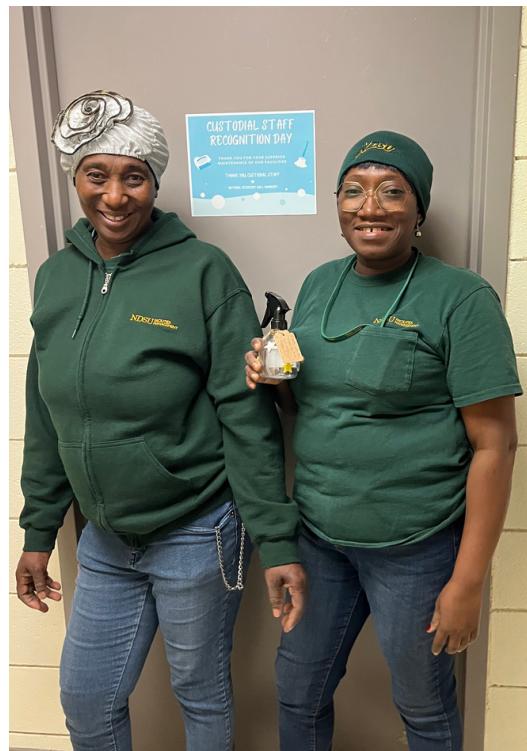
Members of the NDSU Custodial Staff