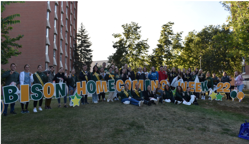
A large group of students who helped make the NDSU campus a cleaner place with Campus Clean Up.