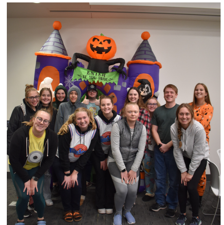
NRHH members at the Halloween themed OTM writing party!

As we wrap up the fall semester, the Bison chapter is proud to share our accomplishments in the recognition sector. We wrote a recognition bid for the NDSU Blue Key Honor Society and nominated them for the MACURH Organization of the Year Award. In October, we found out that Blue Key won and would receive this honor. Check out our bid here! We presented them with the plaque and certificate at a Blue Key meeting in November. They also received a custom can of SPAM that was bedazzled for them.