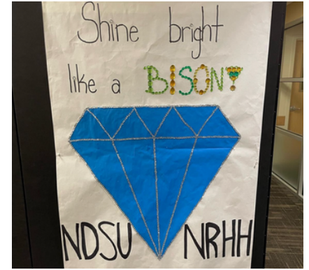
Making our homecoming poster and the final product