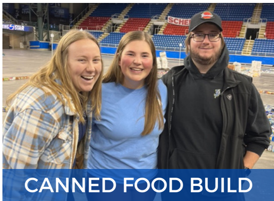
CANNED FOOD BUILD