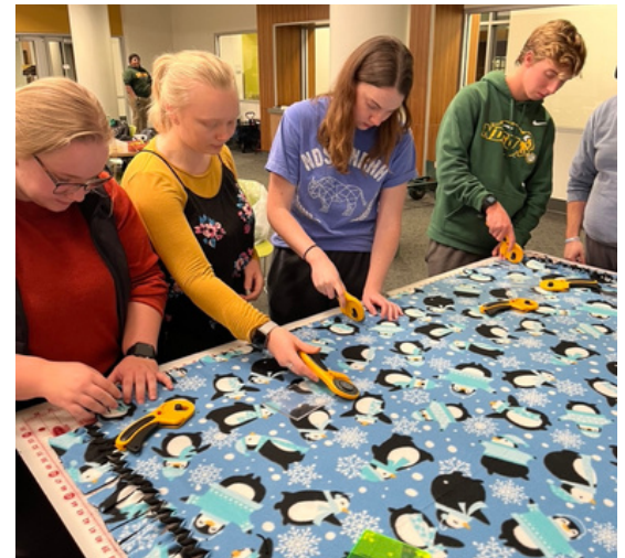
NRHH members working on tie blankets for kids in need.