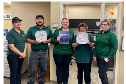
NDSU Dining Staff Employees