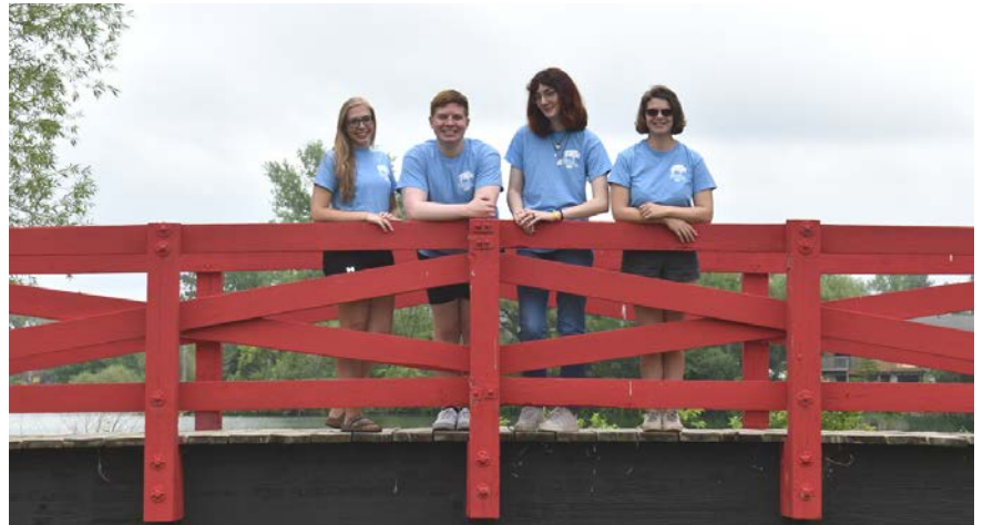
NRHH Exec team at their summer retreat