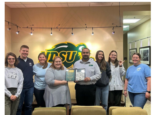
NDSU Office of Admissions