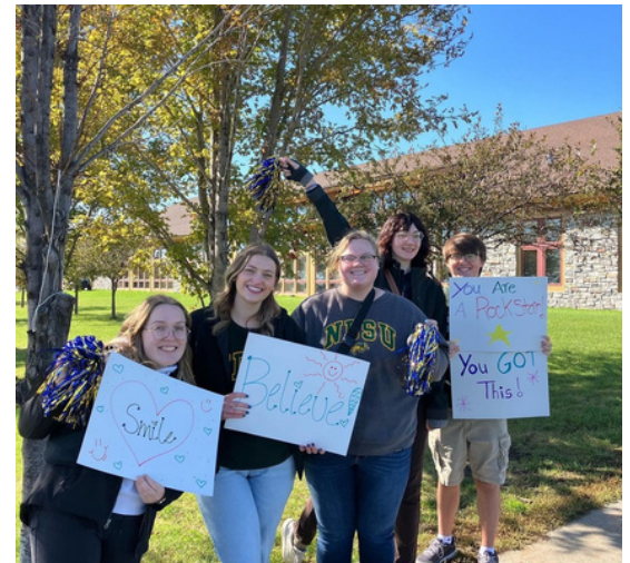
NRHH members cheering on participants at the GiGi's Playhouse Acceptance walk