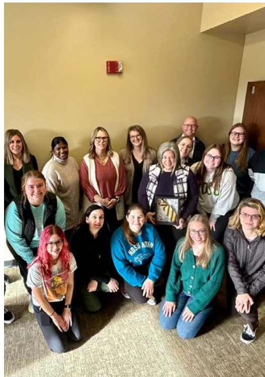
NDSU Career and Advising Staff

We love recognizing entities on campus for their dedication and service to students!