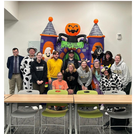
NRHH members at the Halloween themed OTM writing party!

Over the course of the semester, NRHH strives to recognize members and campus partners. We had 7 members receive Diamond of the week and we completed 3 successful recognition days for NDSU entities. Read more about them below!