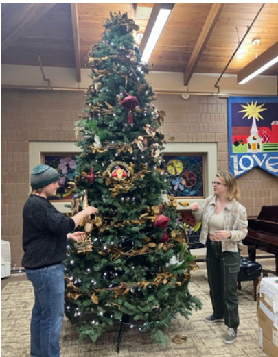
Decorating at Bethany Retirement