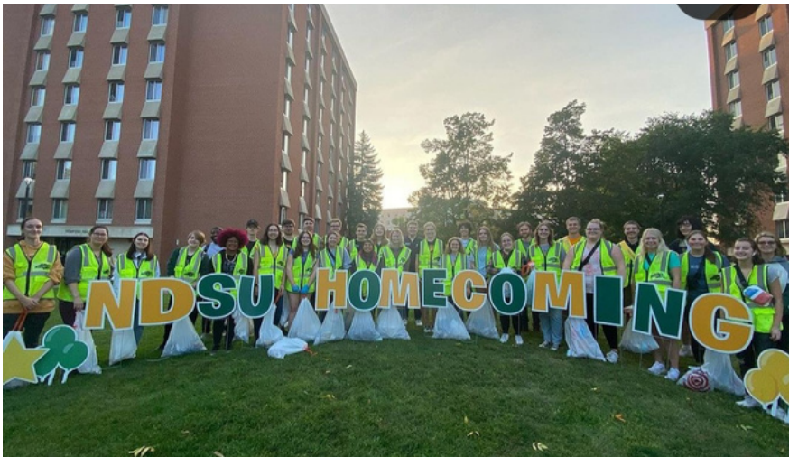
A large group of students who helped make the NDSU campus a cleaner place with Campus Clean Up.