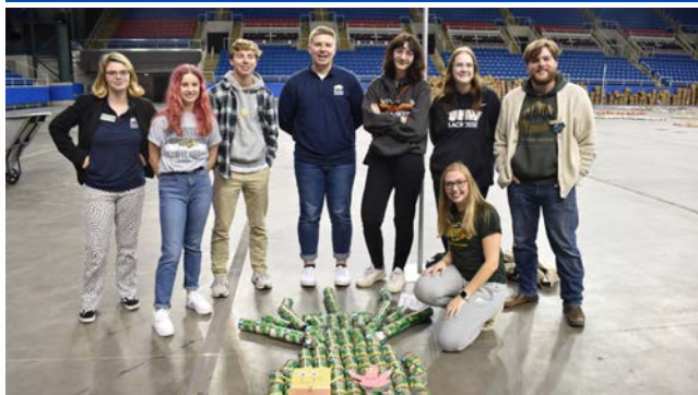
CANNED FOOD BUILD