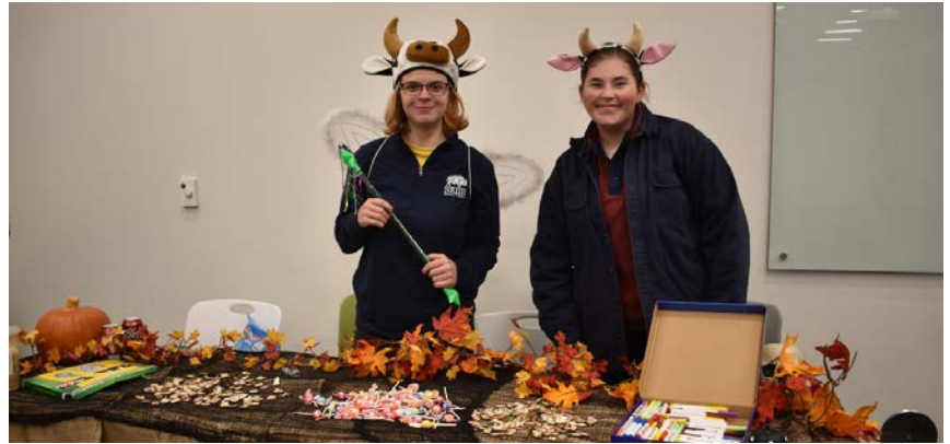
The NRHH crew had a blast helping at Boo! at NDSU