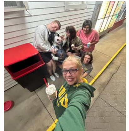
Fun times with exec