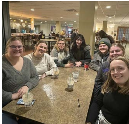
Caribou Coffee Social