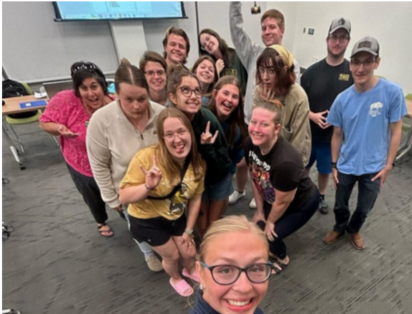
NRHH at the first meeting of the semester