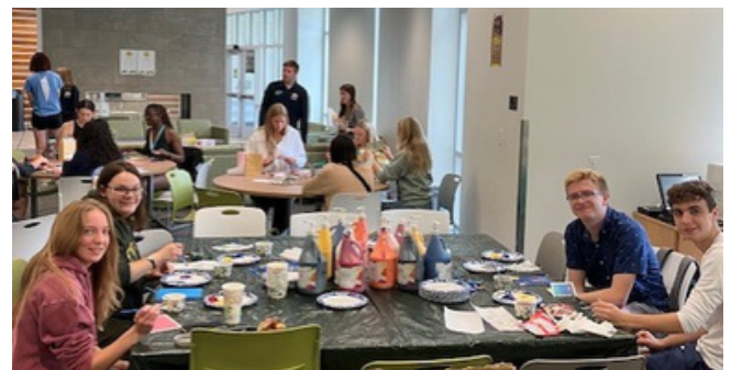
Welcome Week Event