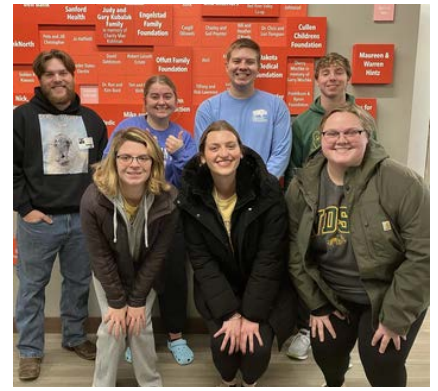
Volunteering at Ronald McDonald House