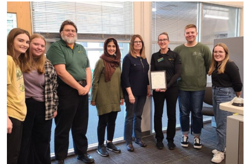
NDSU Dining Staff Employees