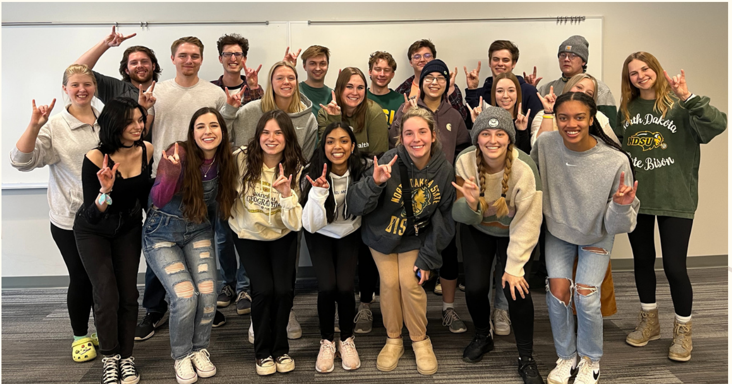
The 2022-23 Ambassadors with the newest Ambassadors for the 2023-24 academic year.