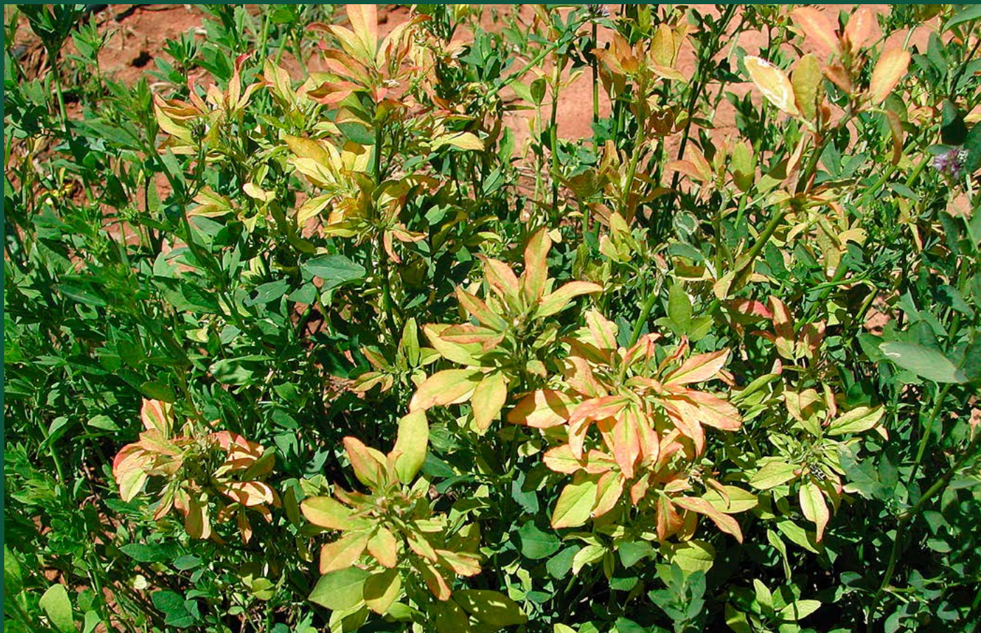
Figure 3. Boron deficiency in alfalfa, Australia.