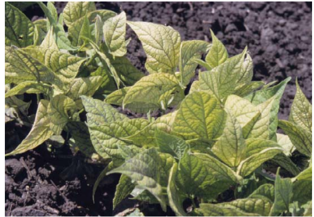
Figure 3. Iron deficiency chlorosis on a saline, calcareous soil near Arthur, N.D.

Iron fertilizer sprays are available but have not alleviated the problem consistently. The severity usually is caused by wet soil conditions that increase soil bicarbonate levels. As soil dries, bicarbonate levels drop and affected plants usually green up. If a field has a known susceptibility to iron deficiency chlorosis, selecting varieties that have shown more tolerance to the conditions is recommended.