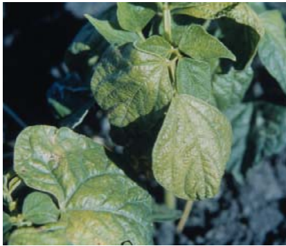
Figure 2. Zinc deficiency in pinto bean.

Foliar applications of zinc chelate products when the plants are small also have been used effectively. Do not apply foliar zinc products with herbicides or other plant protection products because of the chance of increased phytotoxicity to the crop or decreased efficacy to the pest.