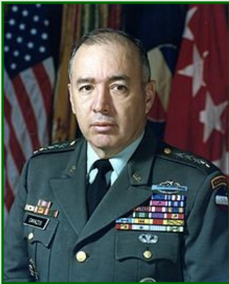
General Richard E. Cavazos U.S. Army

Richard E. Cavazos, a Mexican American, was born in Kingsville, Texas, and served in the U.S. Army for 33 years. He served in combat tours in both the Korean Conflict and the Vietnam War. He was decorated for actions in both conflicts and later, became the first Hispanic American to be promoted to the rank of four-star general.