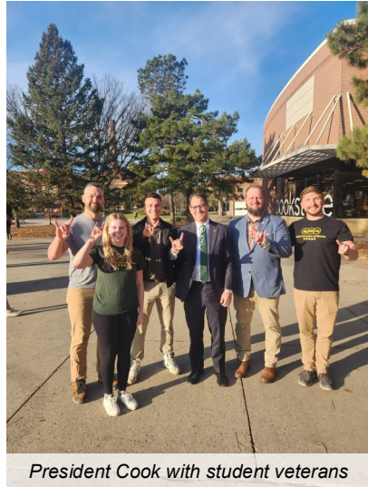
President Cook with student veterans

In other news, we continue to track statistics about GI Bill beneficiary students. The Spring 2024 numbers represent those registered as of January 3, 2024, and are preliminary: Spring 2024 - 303; Fall 2023 - 343; Spring 2023 - 328.