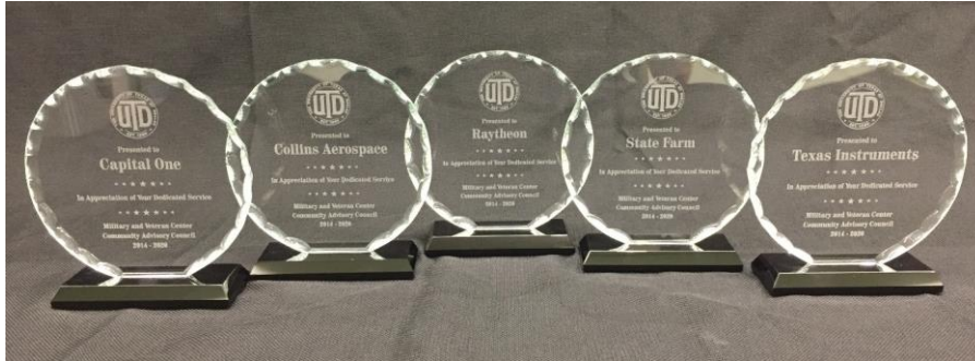
Round/glass recognition plaques awarded for completing 3-year term