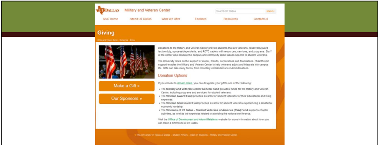
MVC webpage for giving: https://utdallas.edu/veterans/giving/