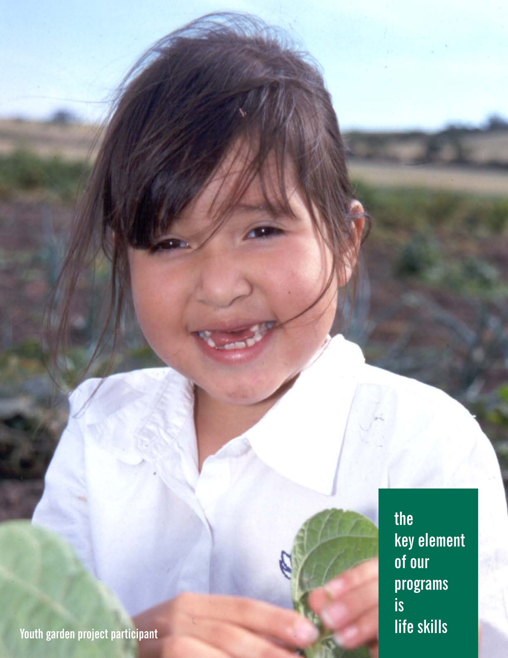
Youth garden project participant

the key element of our programs is life skills