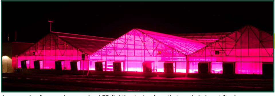
An example of a greenhouse using LED lighting technology that can help boost food production.

REQUEST: The 2015-17 Legislative session provided $600,000/biennium in operating funds for Precision Ag research. These funds are distributed through an internal competitive grants process. In each biennium, funds requested greatly exceeded the amount that was distributed. An increase in Operating ($800,000) is requested to establish a smart crop farm at Casselton and a smart livestock farm at Fargo that utilizes sensors, autonomous systems, and data to make crop management decisions, and to evaluate these decisions in partnership with industries.